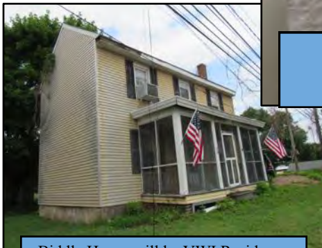
Biddle House will be VWI Residence for out-of-state veteran students