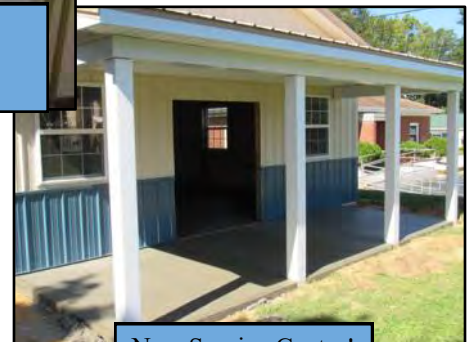
New Service Center!