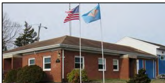
Veterans Watchmaker Initiative Inc.