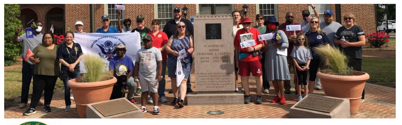
The Dover Mayor's Crisis Awareness Challenge Walk Successfully walked on Saturday May 22nd.