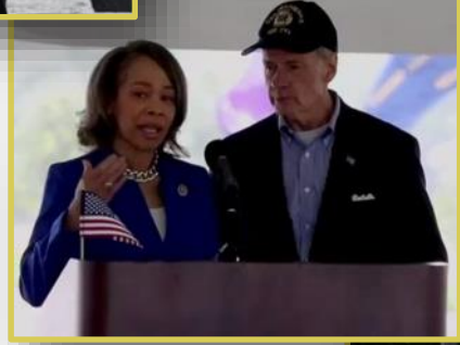
Congresswoman Blunt Rochester and Senator Carper attended the ceremony at the Veterans Memorial Cemetery in Bear.