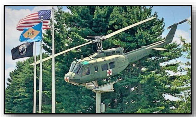
UH1 'Huey' at Dover Veterans Memorial Park