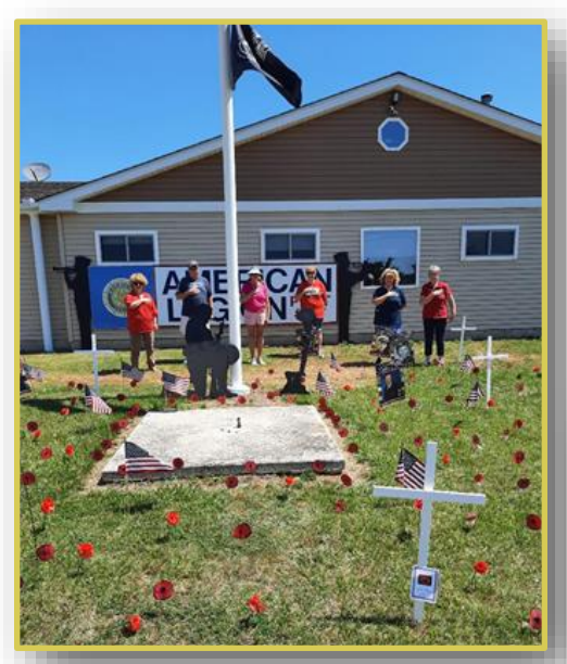
American Legion Auxiliary Unit 17 of Lewes Honors Our Lost Heroes Throughout Town