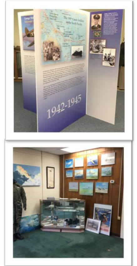
Submitted by: Kennard Wiggins, Curator, Delaware Military Museum